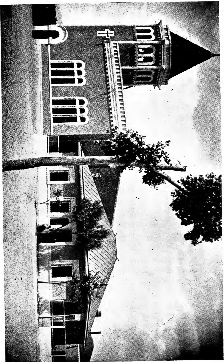
CHURCH EDIFICE AND HOME IN CHIHUAHUA